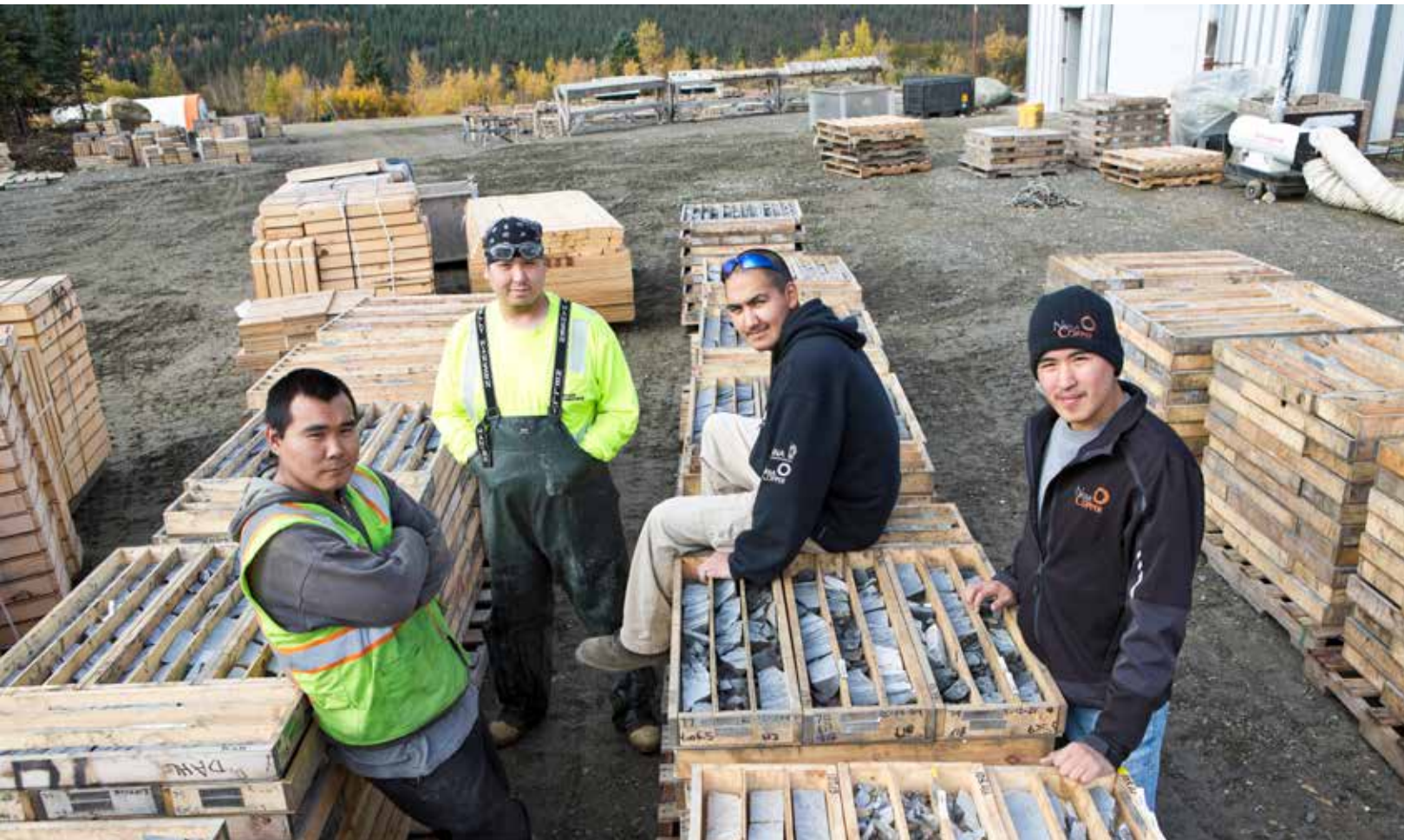
Employees of Trilogy Metals, formerly NovaCopper, at the Upper Kobuk Mineral Project in the Ambler Mining District

This publication was released by the Department of Commerce, Community, and Economic Development (DCCED) in January 2017. This Report is required by AS 44.33.431 (d) and does not constitute an official position or opinion by DCCED.