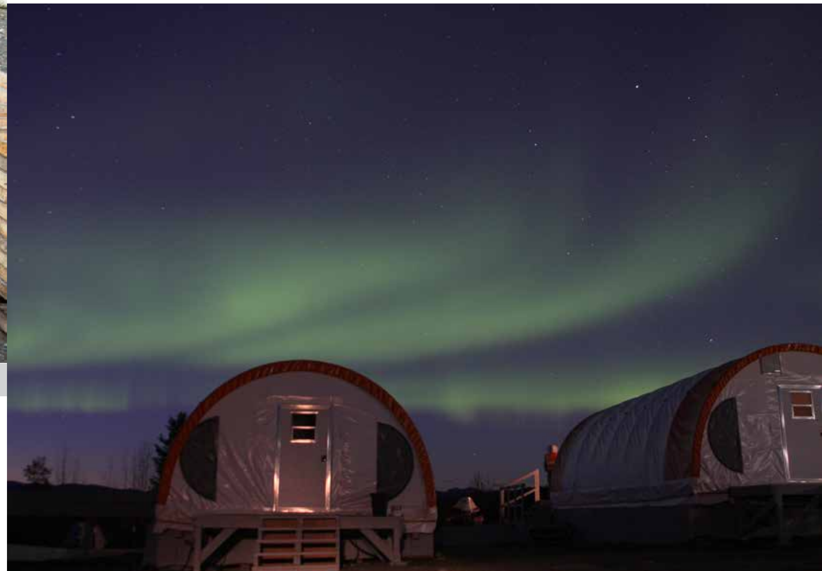
Northern Lights dance above Bornite Camp, Upper Kobuk Minerals Project

This publication was released by the Department of Commerce, Community, and Economic Development (DCCED) in January 2017. This Report is required by AS 44.33.431 (d) and does not constitute an official position or opinion by DCCED.