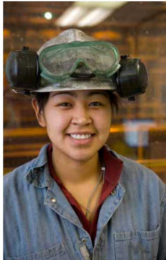
Worker at Red Dog Mine