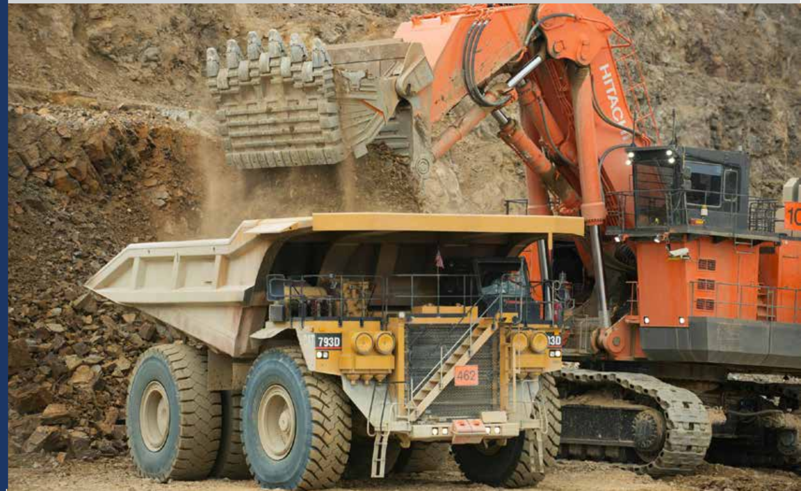
Loading gold ore at Fort Knox

“To communicate the value of mining to the state's economy, education in and marketing on behalf of the mining sector should be prioritized.”