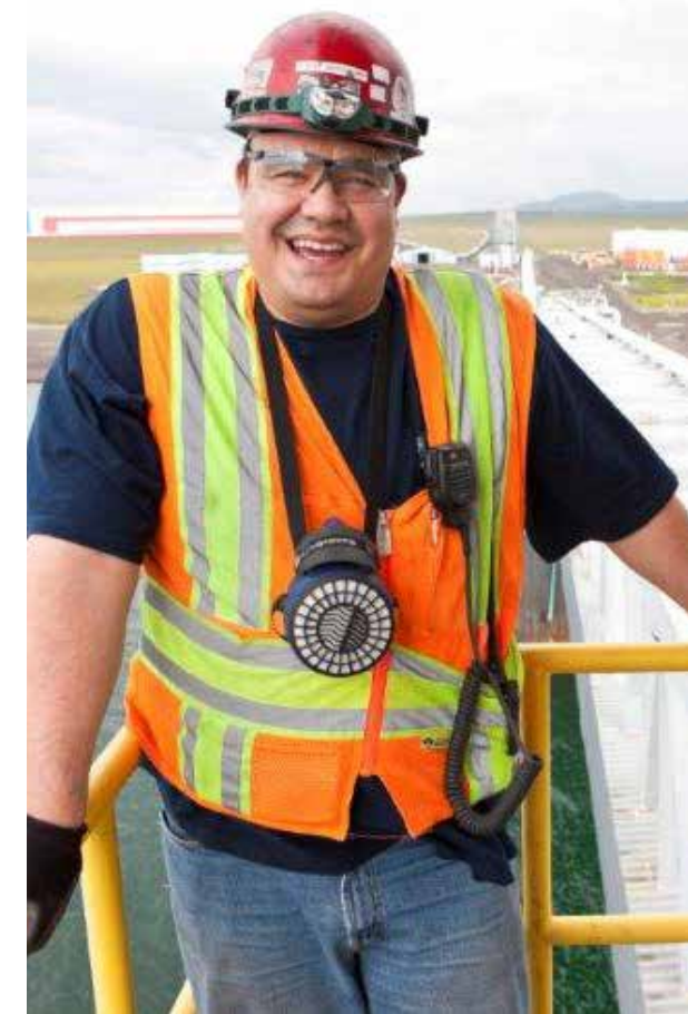
Red Dog Mine