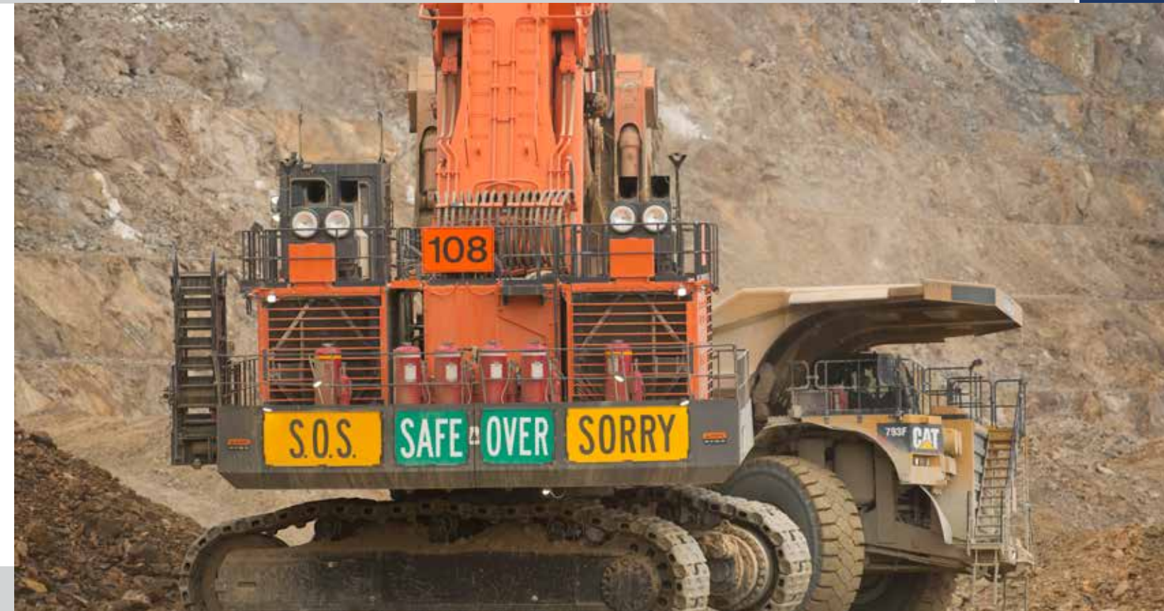
Fort Knox Mine near Fairbanks