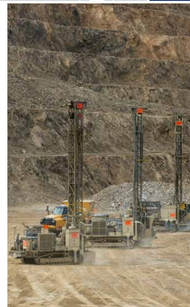
Drilling blast holes at Fort Knox

The Alaska Minerals Commission appreciates the public’s interest in these issues and the support of the Alaska mining industry. Please feel free to contact the Alaska Minerals Commission with comments or concerns at any time.