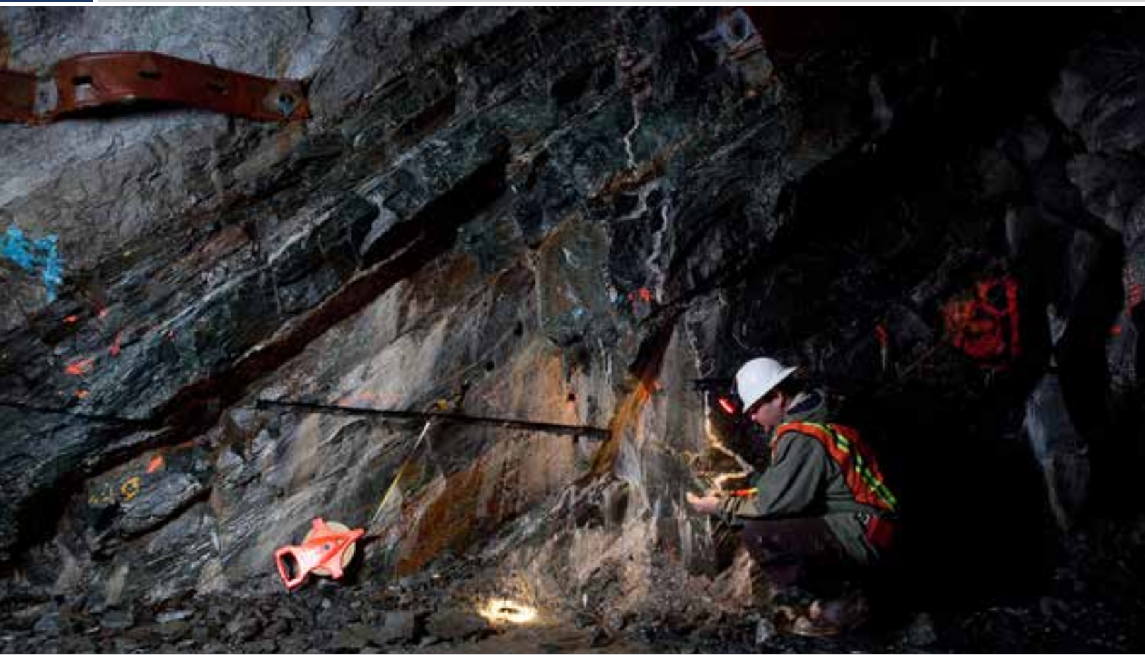
Niblack Project in Southeast Alaska