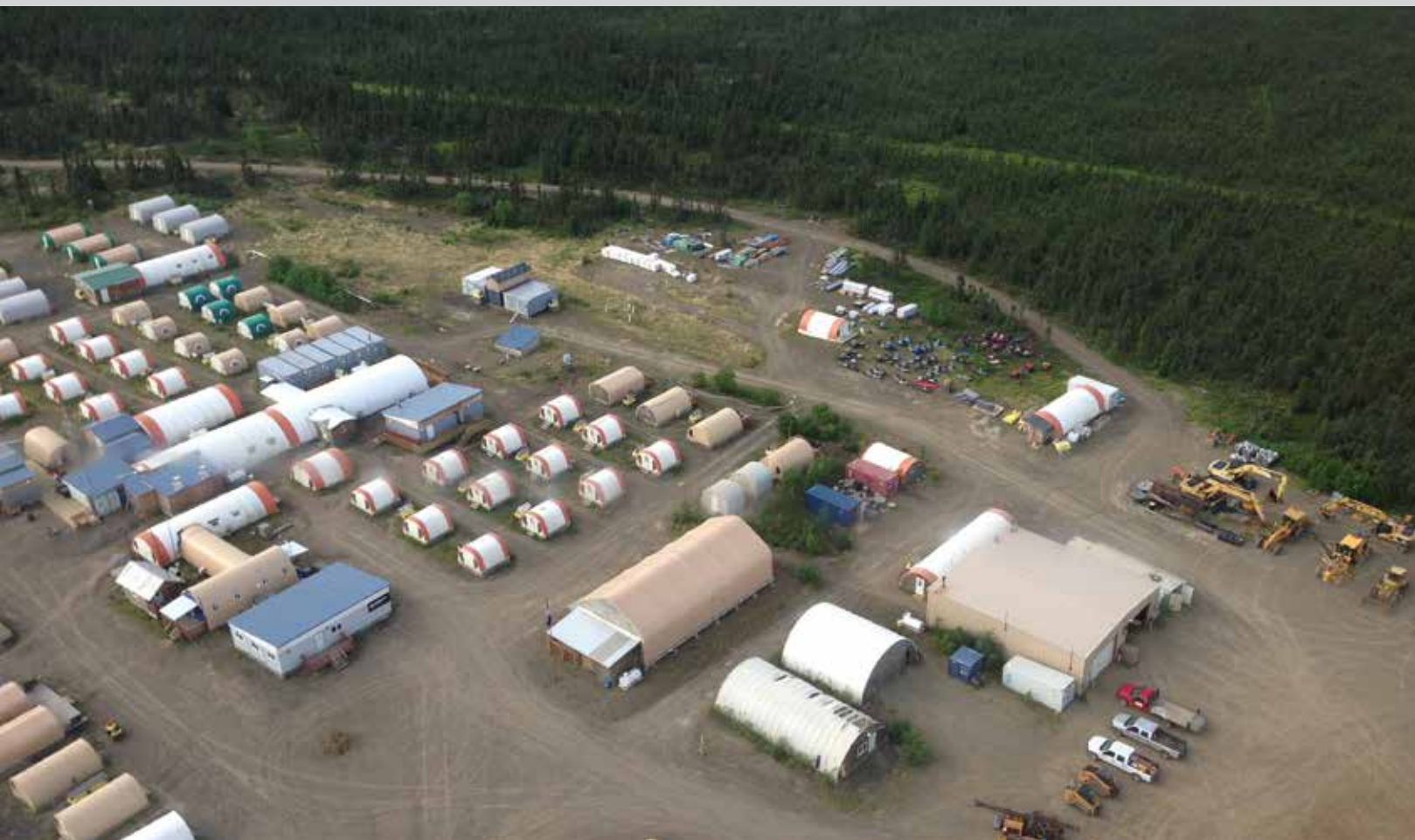
Donlin Gold exploration camp