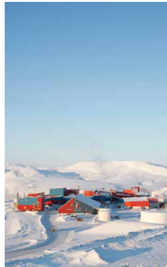
Red Dog Mine