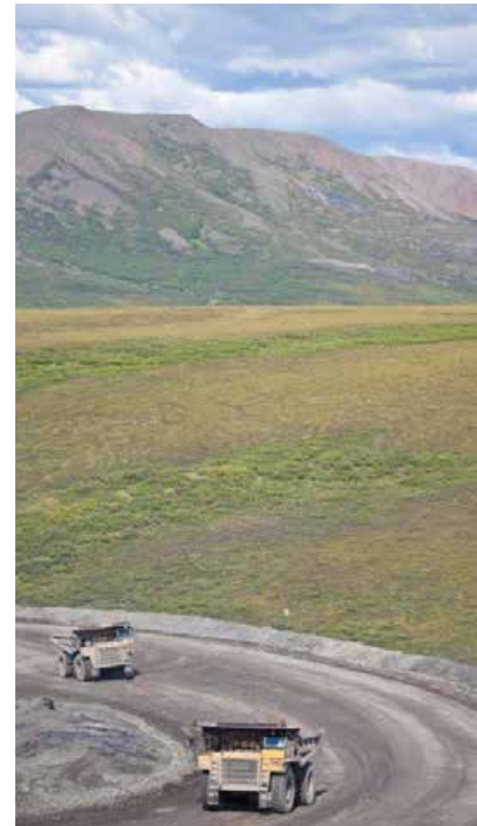
Red Dog Mine