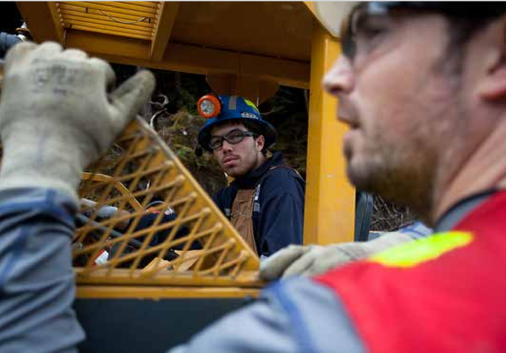
Workers at the Niblack Prospect in Southeast Alaska