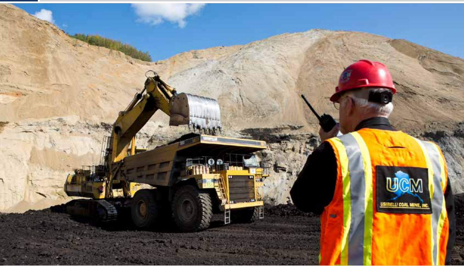
Usibelli Coal Mine