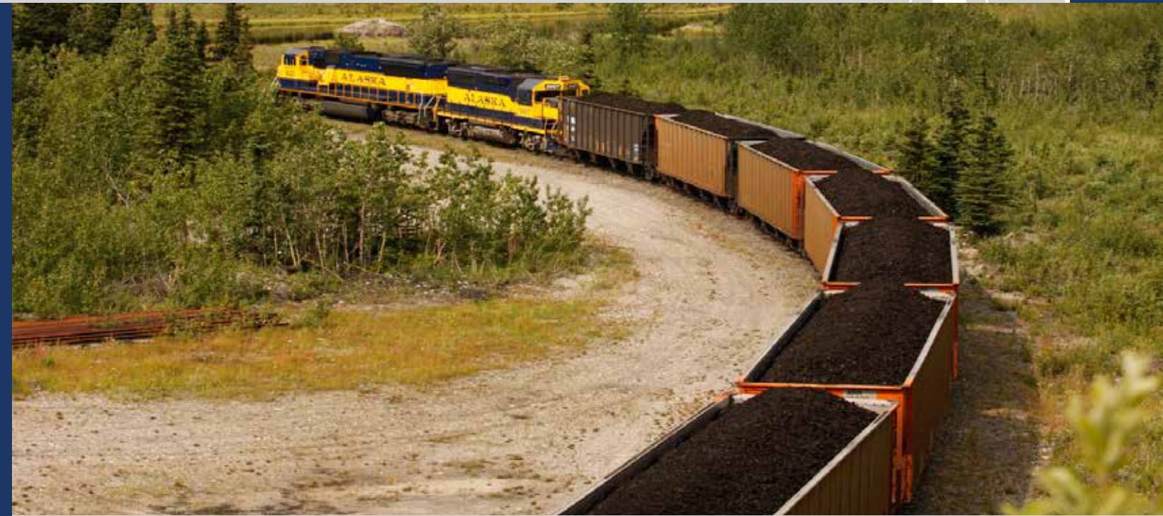
Alaska Railroad transports coal from Usibelli Mine